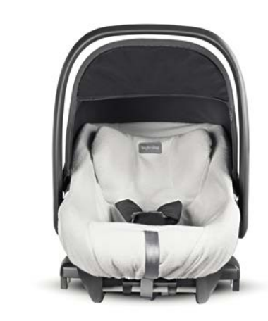
Summer Cover for Darwin Infant Recline car seat A095QV723

Mosquito net for Infant car seat A097KV000