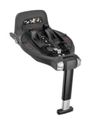
Darwin 360° i Size car base for Darwin Infant, Darwin Infant Recline and Darwin Next Stage i-Size (ECE R129/03) AV04Q0000