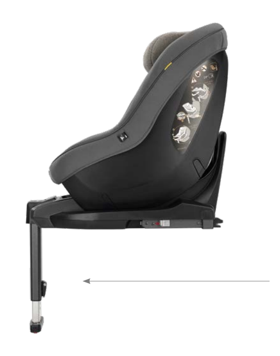
Forward facing after the child is 15 months old, approximately from 76 - 105 cm tall.