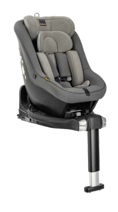
The headrest can be adjusted to 5 positions via a central control, and is integrated with the harness system to easily adapt to the growth of your child.